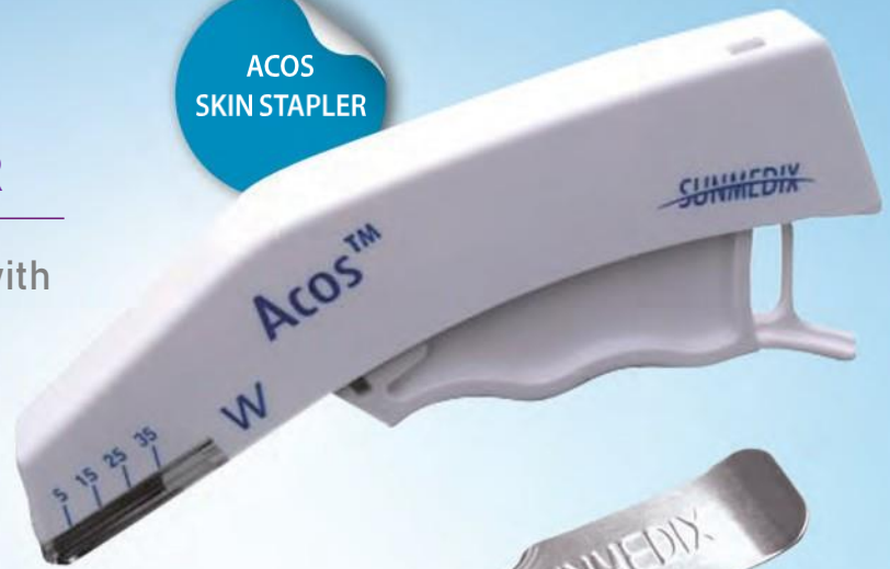
ACOS SKIN STAPLER