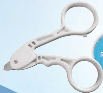
ACOS REMOVER SR2